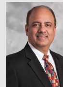
R.I President's Message